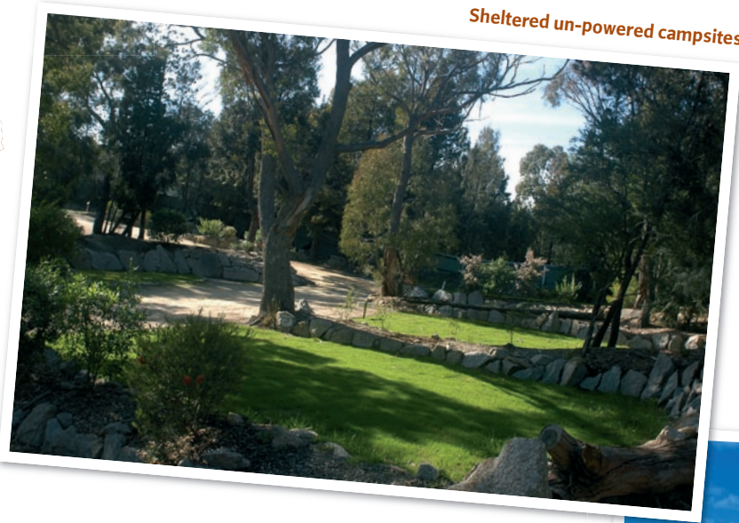
Sheltered un-powered campsites

6 x 4 share dorms, 1 x double room, 1 x family room. Shared kitchen, bathroom and living areas. Great for school camps or groups traveling on a budget.