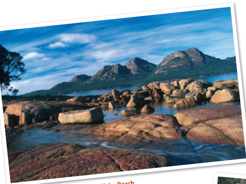
Hazards view from Pirates Point, Muirs Beach