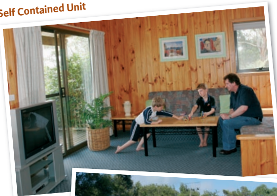
Self Contained Unit