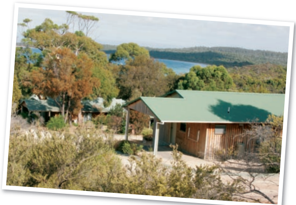
Overlooking the park

Coles Bay and the Freycinet Peninsula enjoy more days of sunshine than anywhere else in Tasmania.