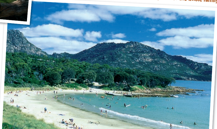
Muir's Beach, safe and friendly fun for the whole family

Travelling times: Approximately 2 hours 30 mins from Launceston or Hobart.